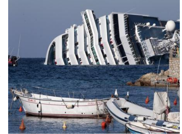
Costa Concordia 2012