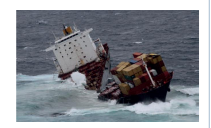
MV Rena 2011

Data obtained from interviews with parties involved in the salvage and wreck removal industry is undertaken to determine the wider industry view of the existing laws and operational challenges for the salvage industry in the short and medium term future.