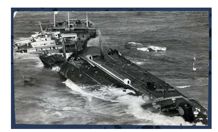
Torrey Canyon 1967

The aim of the research is to examine the evolution of English maritime law of salvage and wreck removal. Salvage law has its origins in the law of equity and has developed over centuries to encourage salvors to provide assistance to vessels in danger. Since the late nineteenth century commercial contracts, in the form of Lloyd's Open Form, have largely been used by the salvage industry. The removal of wrecks, not just those obstructing navigable waters, but wrecks within the exclusive economic jurisdictional waters of coastal States is now not only desirable by those States but enforceable under the Wreck Convention 2007 enacted in to English law as Wreck Removal Convention Act 2011.