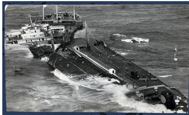
Torrey Canyon 1967

The aim of the research is to examine the evolution of English maritime law of salvage and wreck removal. Salvage law has its origins in the law of equity and has developed over centuries to encourage salvors to provide assistance to vessels in danger. Since the late nineteenth century commercial contracts, in the form of Lloyd's Open Form, have largely been used by the salvage industry. The removal of wrecks, not just those obstructing navigable waters, but wrecks within the exclusive economic jurisdictional waters of coastal States is now not only desirable by those States but enforceable under the Wreck Convention 2007 enacted in to English law as Wreck Removal Convention Act 2011 .