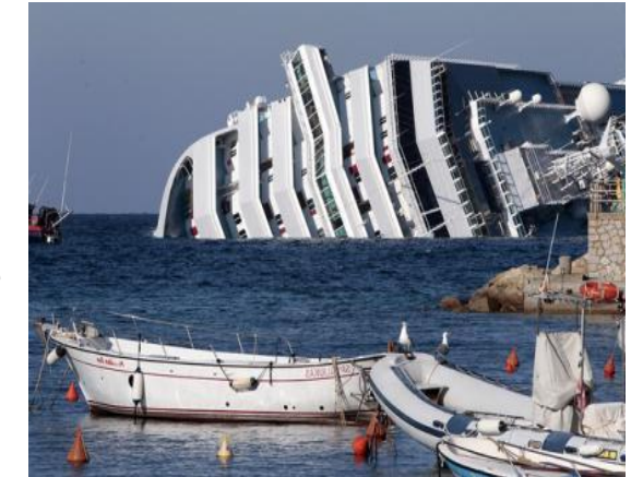
Costa Concordia 2012