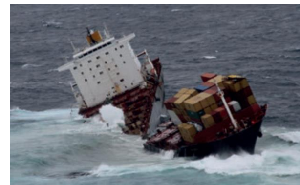
MV Rena 2011

Data obtained from interviews with parties involved in the salvage and wreck removal industry is undertaken to determine the wider industry view of the existing laws and operational challenges for the salvage industry in the short and medium term future.